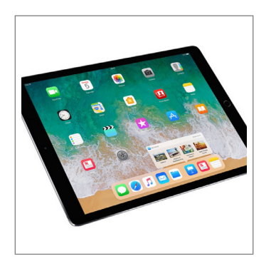
iPad Protection Plan