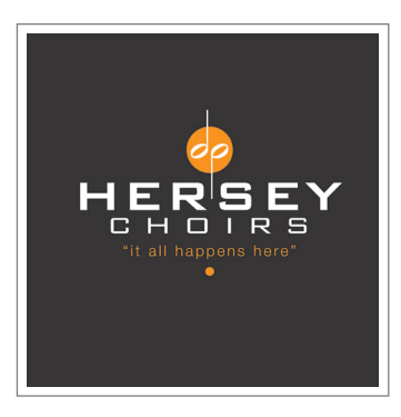
Hersey Choir News