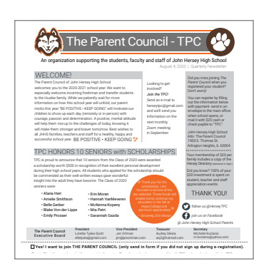
TPC News & Info