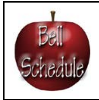
New Bell Schedule