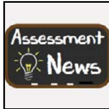
Assessment Center News