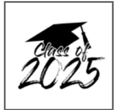
Class of 2025 Graduation News