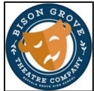
Fall Play Auditions