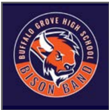
Bison Band News