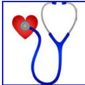
News from the Health Office