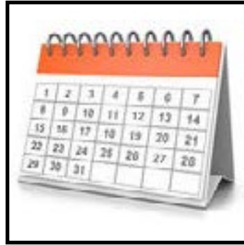
2024-25 Blue & Orange (A&B) Calendar