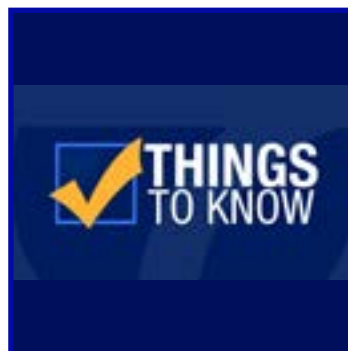
Reporting Absences, Lost & Found, Tip Line