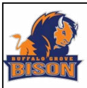
Bison Boosters News